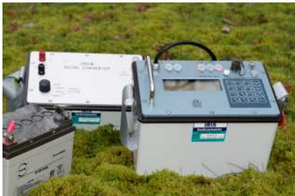
SYSCAL R2 unit