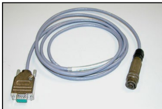
RS232 Serial link