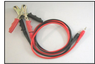
Cords with clips for unit to external Tx battery