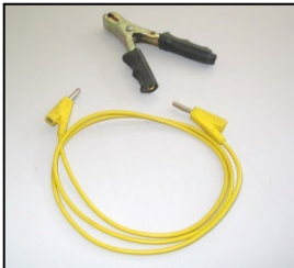
Cord with clip for reel to big size electrode