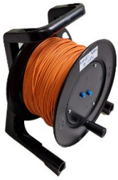
50 and 100 m length wire 1.8 and 2.6 kg