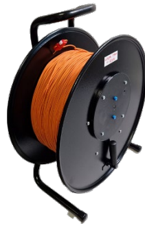
750 m and 1000 m length wire 19 and 23 kg