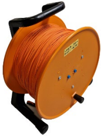
250, 350 and 500 m length wire 4.3 – 5.8 and 7.8 kg