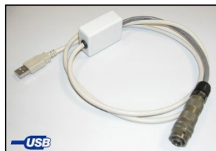
RS232 - USB link