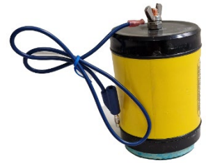
Non-polarizable electrode Cu - CuSO_4 500 g – 13 cm – 8 cm diameter