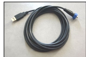
USB - USB link

Specifications subject to change without notice BR_ACC_GC_GB_V2